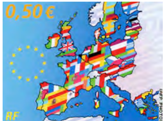
French stamp celebrates EU enlargement

The enlargement crowns efforts by Poland and Germany to overcome the past. They are the largest old and new members of the EU, with about 80 million and 40 million citizens respectively.